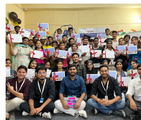
New Kondli IT Centre's Inaugural Graduation Ceremony

The Daan Utsav celebration saw students and staff fervently advocating for giving back. Aligned with a national campaign, we promoted cleanliness and awareness in various areas, receiving a warm response from the community. During this week, Udayan Care's homes organized diverse activities, from distributing essentials to conducting hygiene sessions, embodying the spirit of giving and positively impacting communities.