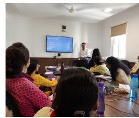
Insightful Workshop on World Mental Health Day

The USF prioritises workshops for skill development, personal growth, and career orientation. Over Oct & Nov, we conducted 203 workshops across 34 locations, covering topics like communication, team work, mental health, & more. In the Selection Process 2023-24, the program expanded to 34 locations, adding 75 new beneficiaries, and emphasising its commitment to supporting underprivileged young women. Additionally, a collaboration with EY introduced computer courses across nine chapters, aiming to enhance Shalini's digital skills, providing financial support and certifications upon completion to empower their personal & professional growth.