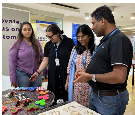
Sukriti's Sparkling Diwali Show

Sukriti's Diwali extra vaganza across seven locations dazzled with vibrant festive products. From hand-painted diyas to stunning gifting items, our collection celebrated Diwali, Navratri, and more, infusing homes with festive elegance. Beyond showcasing craftsmanship, our stall fostered new connections, sharing Sukriti's vision of empowerment. Every purchase supports women at Sukriti, driving positive change in lives and communities.