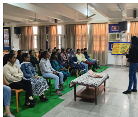
Udayan Shalini Fellowship Hosts 203 Transformative Workshops