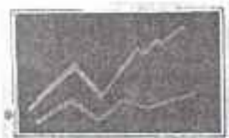
The Udayan Care graph – ever upwards