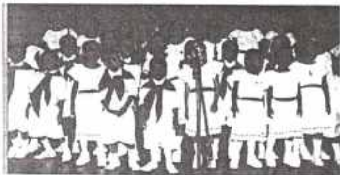
A rousing version of "Guantanamera" from the Udayan Care children at the Latin American & Caribbean Extravaganza Fundraiser

Care. The Ambassadors of Cuba, Colombia, Venezuela, Brazil, Trinidad & Tobago, Uruguay and Spain came together to host a 'Latin American and Caribbean Extravaganza' Gala Dinner and Ball at Delhi's prestigious Taj Hotel. In their turn, Taj co-sponsored the Fund Raising and Awareness event on 29 th April 2000.