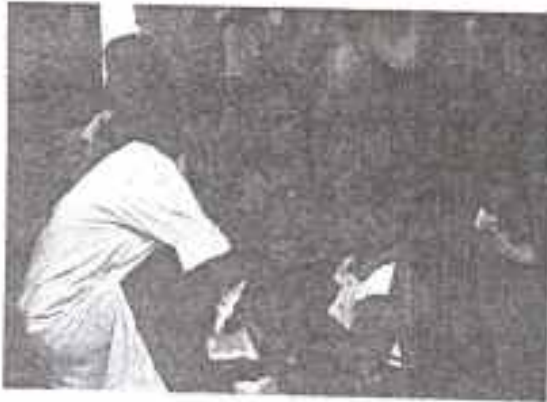
Love unites the Udayan Care brothers and sisters