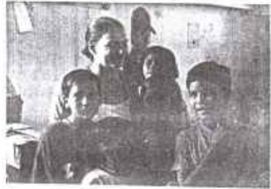
Shah Rukh Khan looks on as Udayan Care children smile at the camera

For this, Udayan Care thanks all its supporters, friends, well wishers and donors, who are contributing so positively to make the lives of the