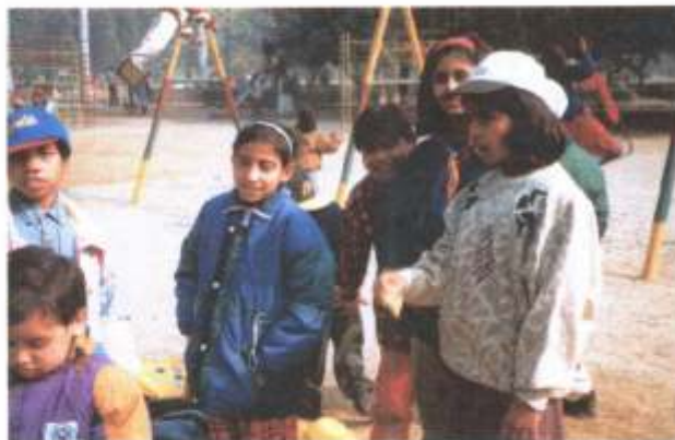
Children's Park, India Gate since the zoo was closed.