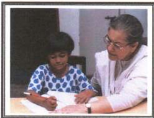
One of the mentor mothers with our third child at Ghar III

These children too, have been on several educational and leisure excursions.