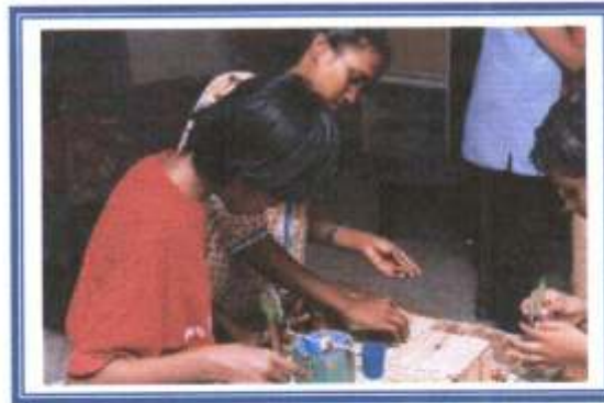
Our children at work with their voices and hands!