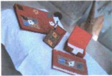
Some of our specially designed Corporate gifts

CORPORATE GIFTS: We design gifts for the corporate sector, which are then sold, and the proceeds go towards meeting the expenses of Udayan Care Trust.